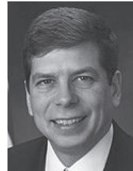
U.S. SENATOR MARK BEGICH

Senator Mark Begich is in his third year representing Alaska in the U.S. Senate, where his primary focus is building a strong Alaska economy. Already in his short time in the Senate, Senator Begich has risen to key positions for Alaska. He was recently named