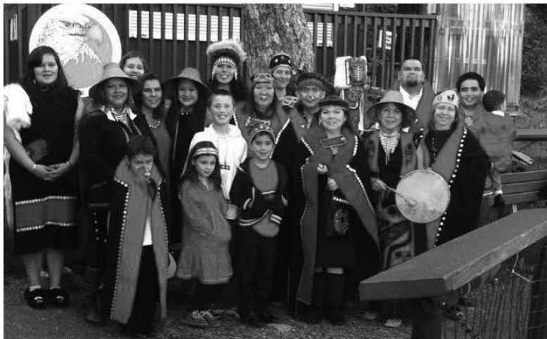
YEE CKU QO DANCE GROUP