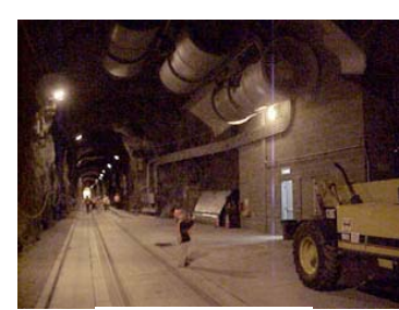
safe-houses 1 and 8, you may encounter wind turbulence from the jet fans.