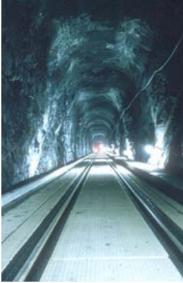
Concrete road surface in tunnel